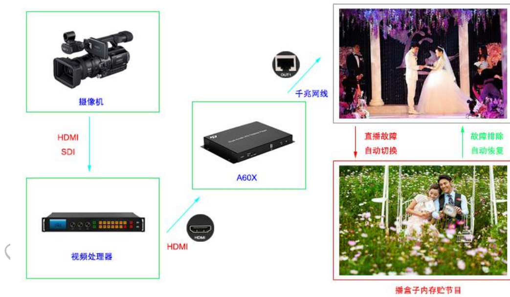
Display camera images synchronously